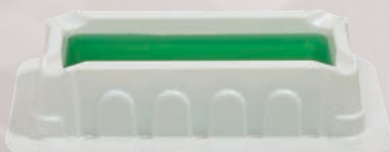
10mL - ER-010