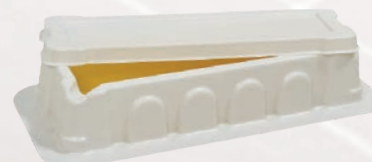
25mL w/ Lid - ER-025