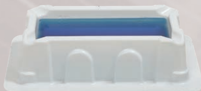
25mL - ER-0258