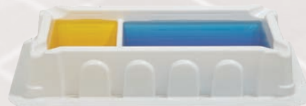
50mL Divided - ER-051