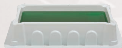
100mL - ER-0100