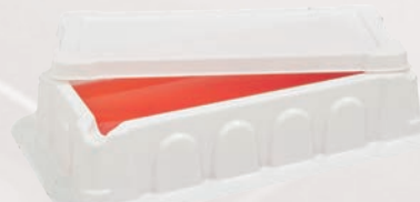
50mL w/ Lid - ER-050