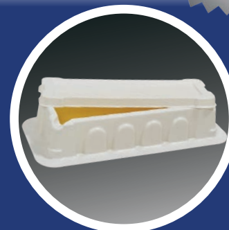
Standard 25mL and 50mL supplied with protective lids