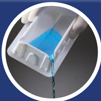
Spouts on all four corners for easy pouring in any hands